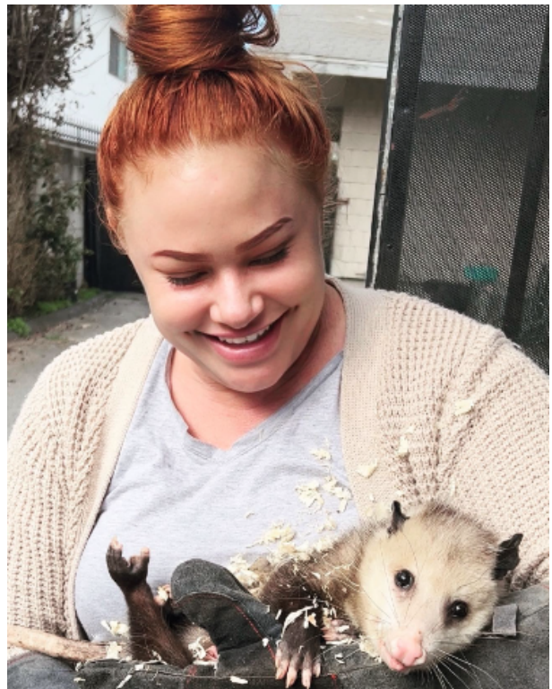
Cleo's Critter Care founder cradling an opossum who came into her care after being trampled by a horse in January. The critter was successfully rehabilitated and released back into the wild in March 2024.

You can continue to help these efforts by getting the word out about Cleo's Critter Care, donating to our non-profit, or volunteering to help wildlife in need.